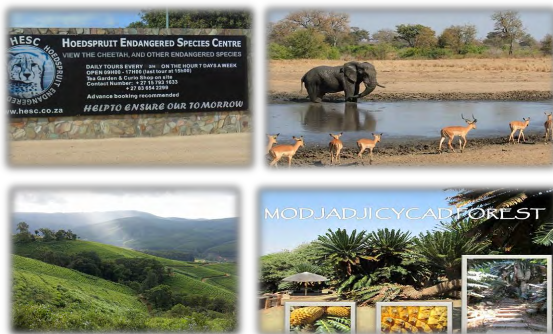
Figure 2: Pictures of some of the main tourist attractions in Limpopo (from top left) Hoedspruit Endangered Species Centre, Kruger National Park, Magoebaskloof and Modjadji cad forest (Pictures courtesy of SA-venues.com).

The Mopani district cements its position as a tourism harbour in Limpopo with the Modjadji Cycad Forest. This is the largest concentration of a single cycad species in the world. It is home to some of the largest and oldest cycads in the world (Mopani District Municipality, 2014). The nutrition of tourists is balanced by the Mopani Worm which is known for its high nutrition qualities and is an essential element of the local cuisine. The Giyani are largest display of Shangaan and Tsonga culture in the form of food, clothes and music. The area also boasts a plethora of historical, cultural and ethnic attractions. The contrasts in climate, scenery and landscape within this region are very striking and dramatic.